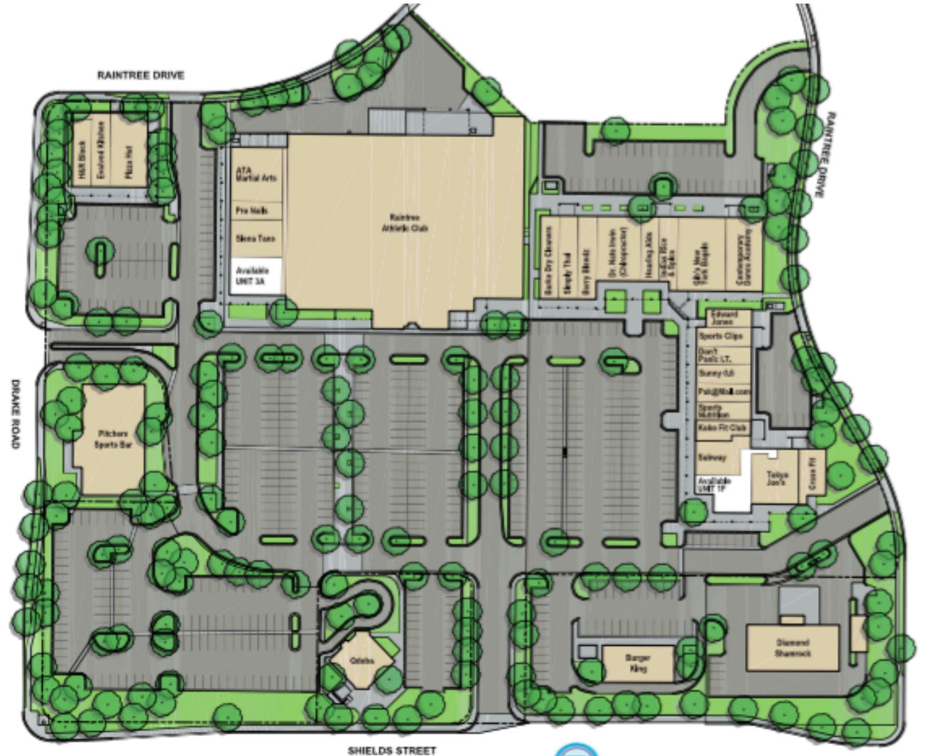
Raintree Site Plan